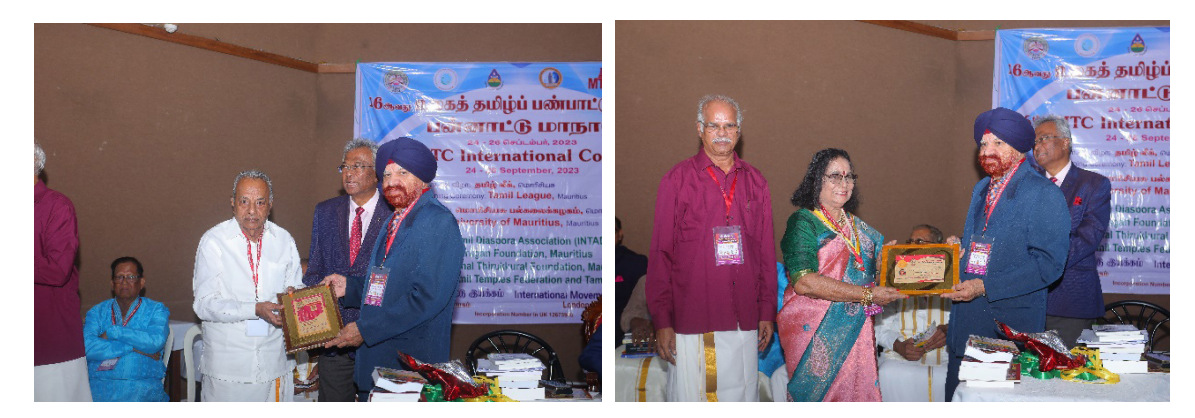
16ஆவது உலகத் தமிழ்ப் பண்பாட்டு இயக்க பன்னாட்டு மாநாடு 2023 – அறிக்கை