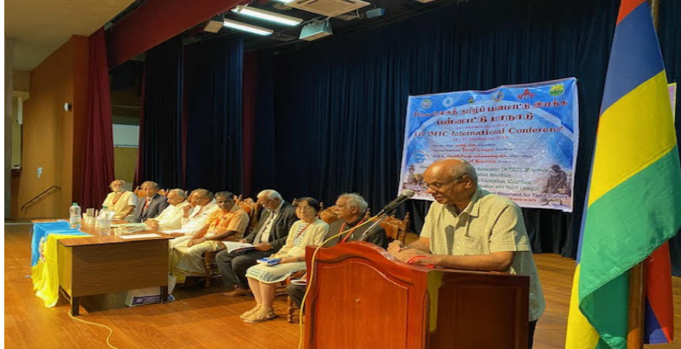
16ஆவது உலகத் தமிழ்ப் பண்பாட்டு இயக்க பன்னாட்டு மாநாடு 2023 – அறிக்கை