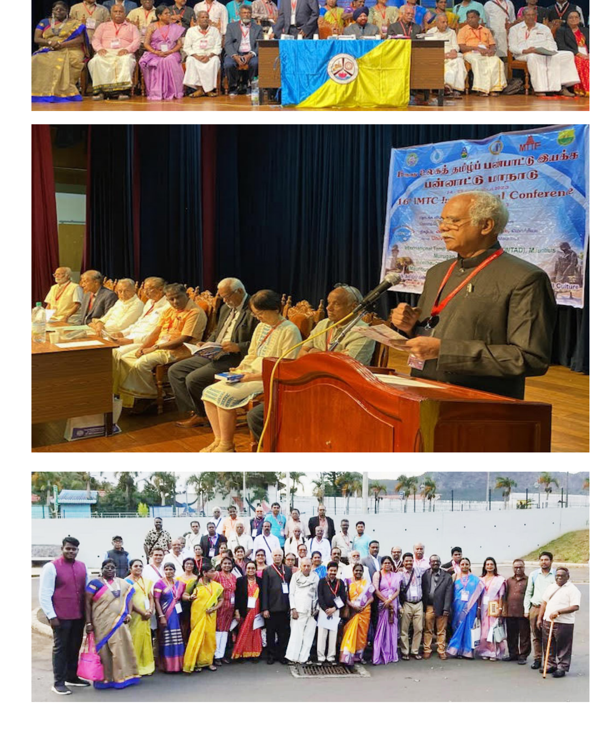
16ஆவது உலகத் தமிழ்ப் பண்பாட்டு இயக்க பன்னாட்டு மாநாடு 2023 – அறிக்கை