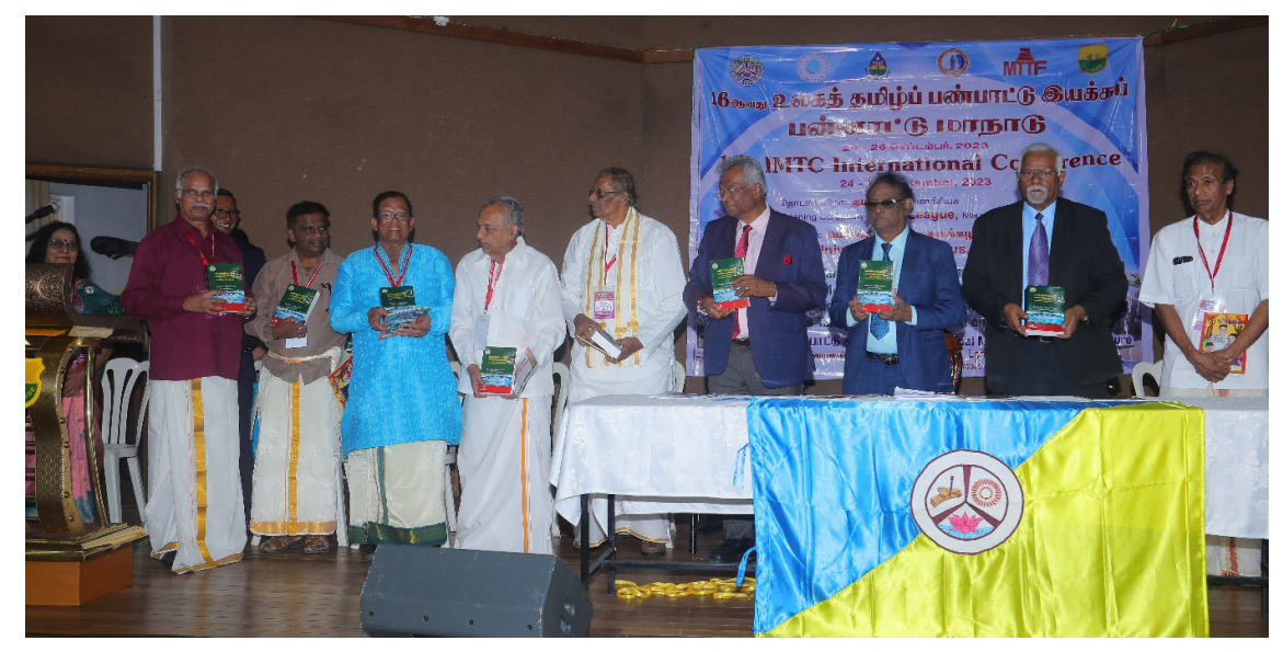
16ஆவது உலகத் தமிழ்ப் பண்பாட்டு இயக்க பன்னாட்டு மாநாடு 2023 – அறிக்கை