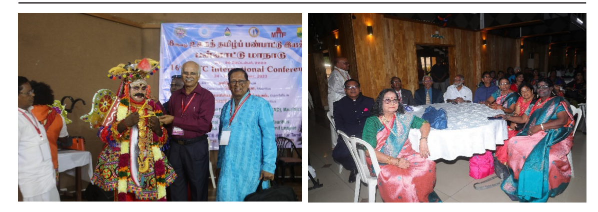
16ஆவது உலகத் தமிழ்ப் பண்பாட்டு இயக்க பன்னாட்டு மாநாடு 2023 – அறிக்கை