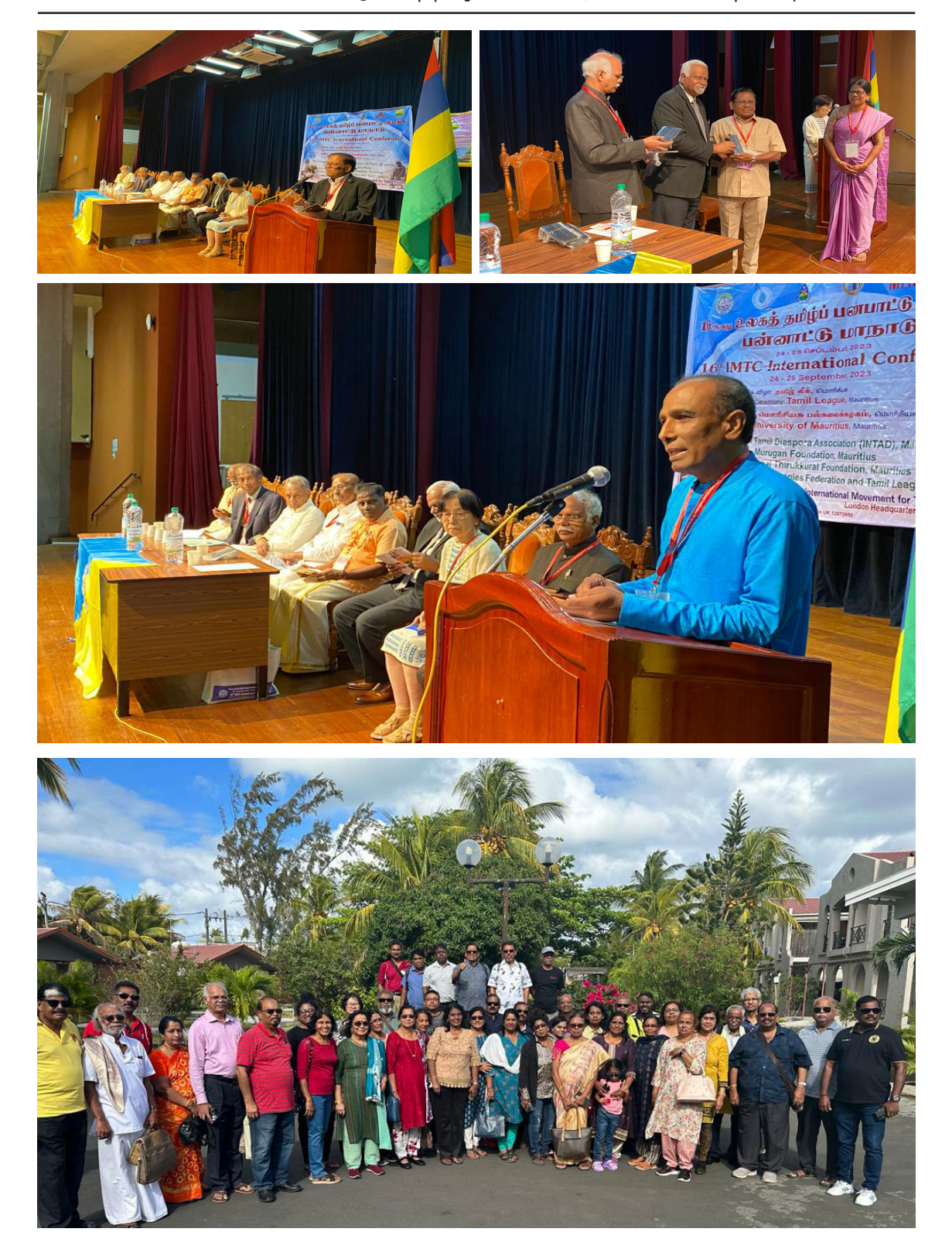
16ஆவது உலகத் தமிழ்ப் பண்பாட்டு இயக்க பன்னாட்டு மாநாடு அறிக்கை – 2023