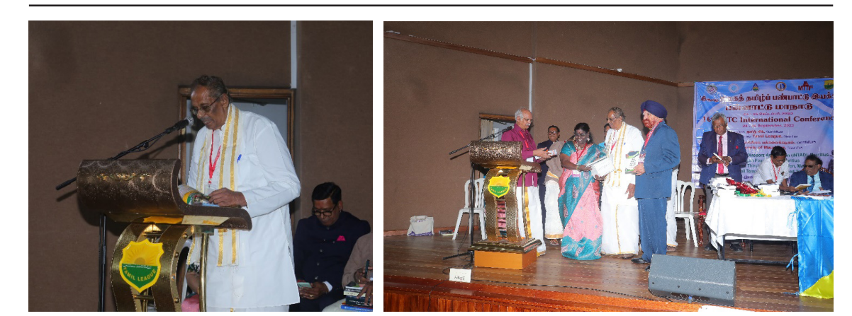
16ஆவது உலகத் தமிழ்ப் பண்பாட்டு இயக்க பன்னாட்டு மாநாடு 2023 – அறிக்கை