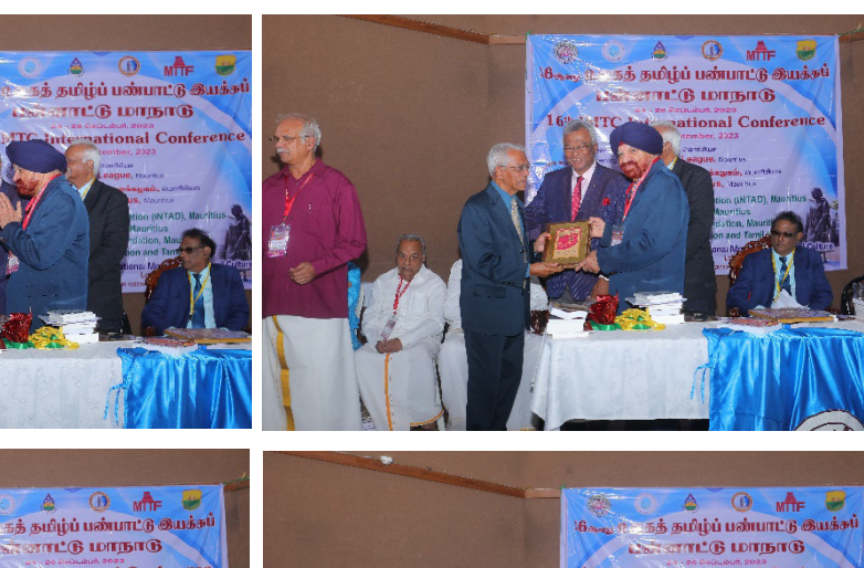
16ஆவது உலகத் தமிழ்ப் பண்பாட்டு இயக்க பன்னாட்டு மாநாடு 2023 – அறிக்கை