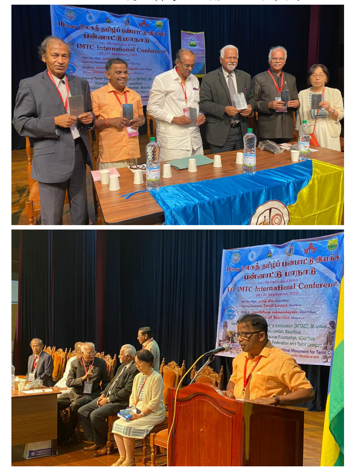
16ஆவது உலகத் தமிழ்ப் பண்பாட்டு இயக்க பன்னாட்டு மாநாடு அறிக்கை – 2023