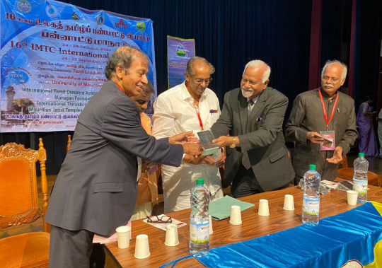
16ஆவது உலகத் தமிழ்ப் பண்பாட்டு இயக்க பன்னாட்டு மாநாடு 2023 – அறிக்கை